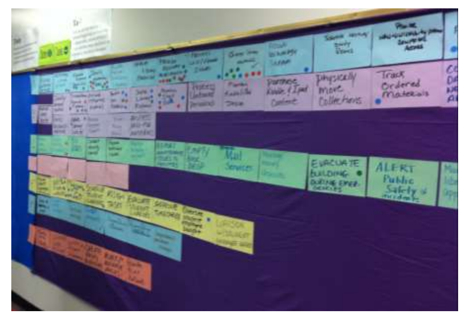
@2017 FACILITATION CENTER AT EKU WORKSHOP: DACUM OCCUPATIONAL ANALYSI